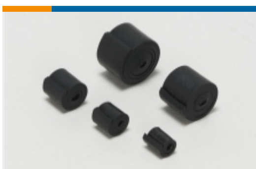
Bushings & Bobbins(5)