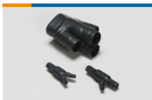
Cable Transitions & Breakouts(1)